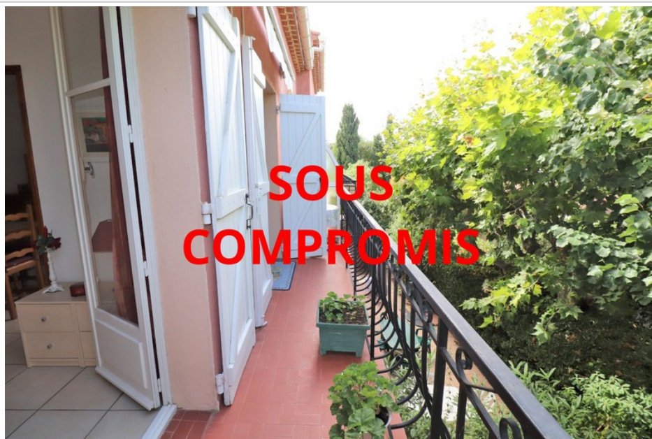
Apartment 1873 La Ciotat

In the popular area of Clos des Plages and 100 m from the beaches, magnificent type 2 crossing and bright. It consists of a living room with open kitchen, a bedroom all opening onto a shaded balcony. A private parking space accompanies this property. Ideal seasonal rental or pied à terre close to the beaches.